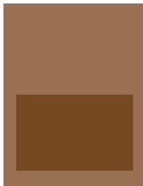
Half Page Horizontal